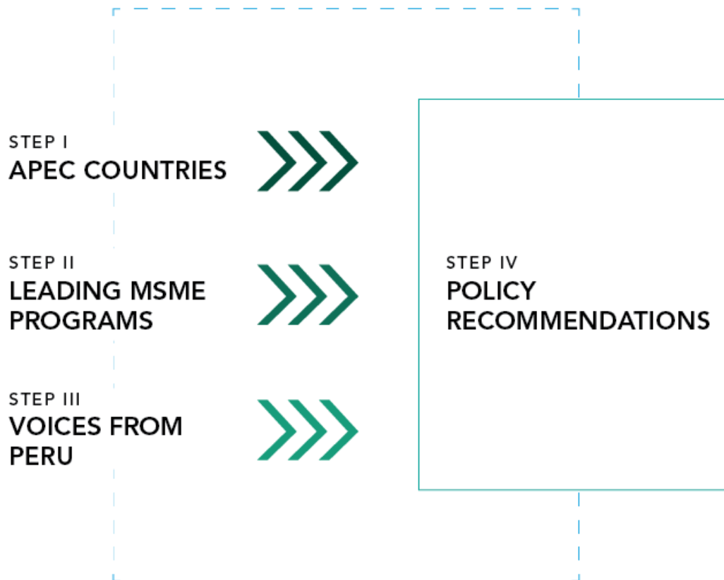
FIGURE 1 Methodology

In Step I (literature review), a comparative analysis of the existing policies that aim to support MSMEs in five mining countries (Australia, Canada, Chile, Mexico, and Peru) from the APEC community was conducted. A tailored framework for the assessment of MSME policies was developed encompassing five indicators: social entrepreneurship, taxation, gender equality, funding, and institutional capacity.